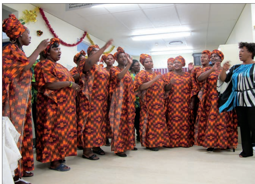
The Sizophila choir.

A review of the programme's outcomes confirmed what many first-world HIV programmes and other chronic disease clinical services were showing: that adolescents often experience a turbulent transitional developmental phase and may experience significant challenges in traditional ART programmes. Despite growing up in the clinic